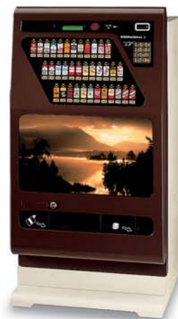
INTERNATIONAL L Special colour brown/beige