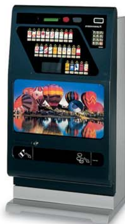
INTERNATIONAL M Standard colour anthracite/grey